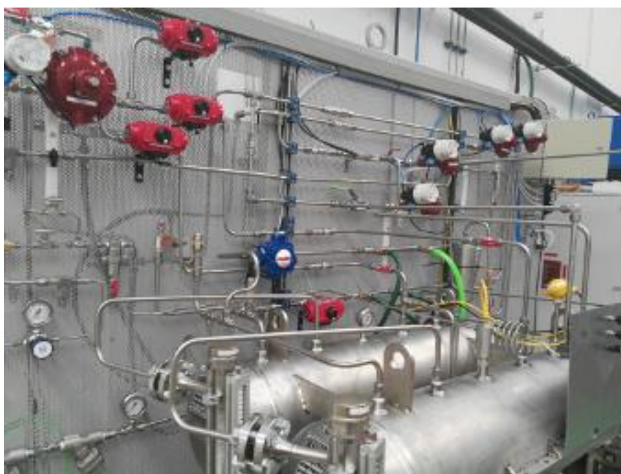
Figure 2. Pilot test bench, intermediate scale, erected at FHA facilities

Task 3.3 is the development and use of an intermediate scale test bench in the project, done at FHA facilities. For this purpose, a dedicated test bench able to operate at high pressures and current densities has been erected by FHA. Besides, FHA has developed an accelerated stress protocol to test the materials under highly extreme and dynamic conditions in order to check and extrapolate the materials performance. IHT will provide the stacks to be tested with the materials coming from task 3.2 and the most promising materials will be tested in WP5